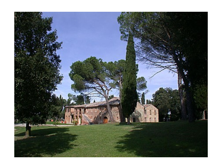
Villa 22 people Swimming pool Siena 25 kms.