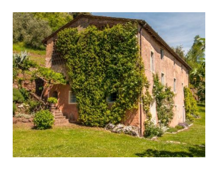
CASA DAMIANO 10 people Swimming Pool Lucca 11 kms.