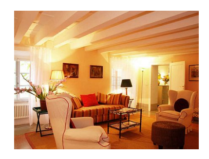
Apartment 4 + 1 people Historical centre of Lucca